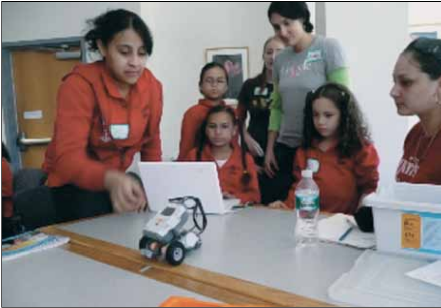
A Girls Inc. Holyoke team learned to build and program robots at Girls Connect FIRST Robotics event at UMass Amherst. Similar activities were suggested for the Holyoke GHPCC.

and policy issues (such as data privacy); has a long term strategy which incorporates planned evolution; and is supported by a viable and cost-effective business model.