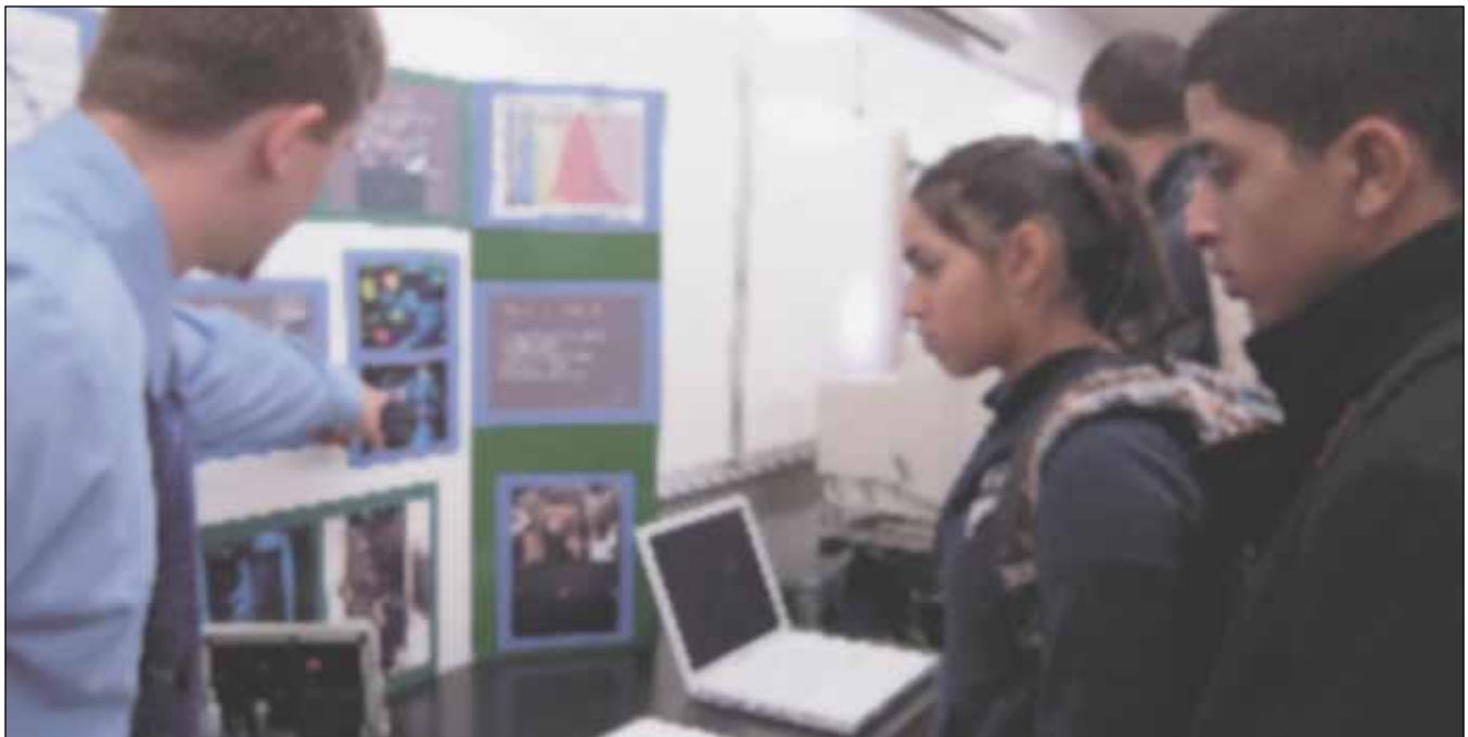
Springfield Technical Community College students share their technology projects with high school students each spring. The Holyoke GHPCC could be a host to events like these in the future.